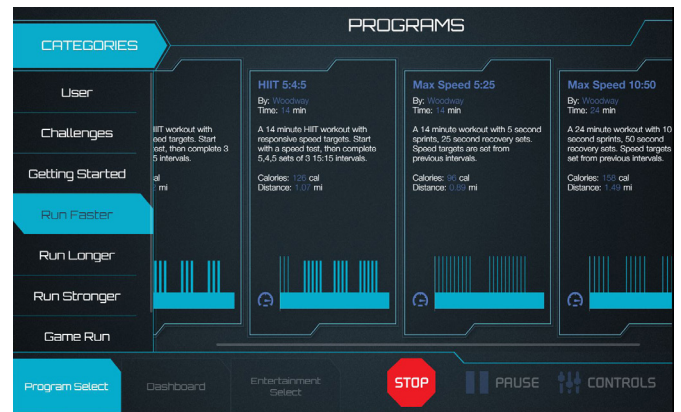
ProSmart Programs View