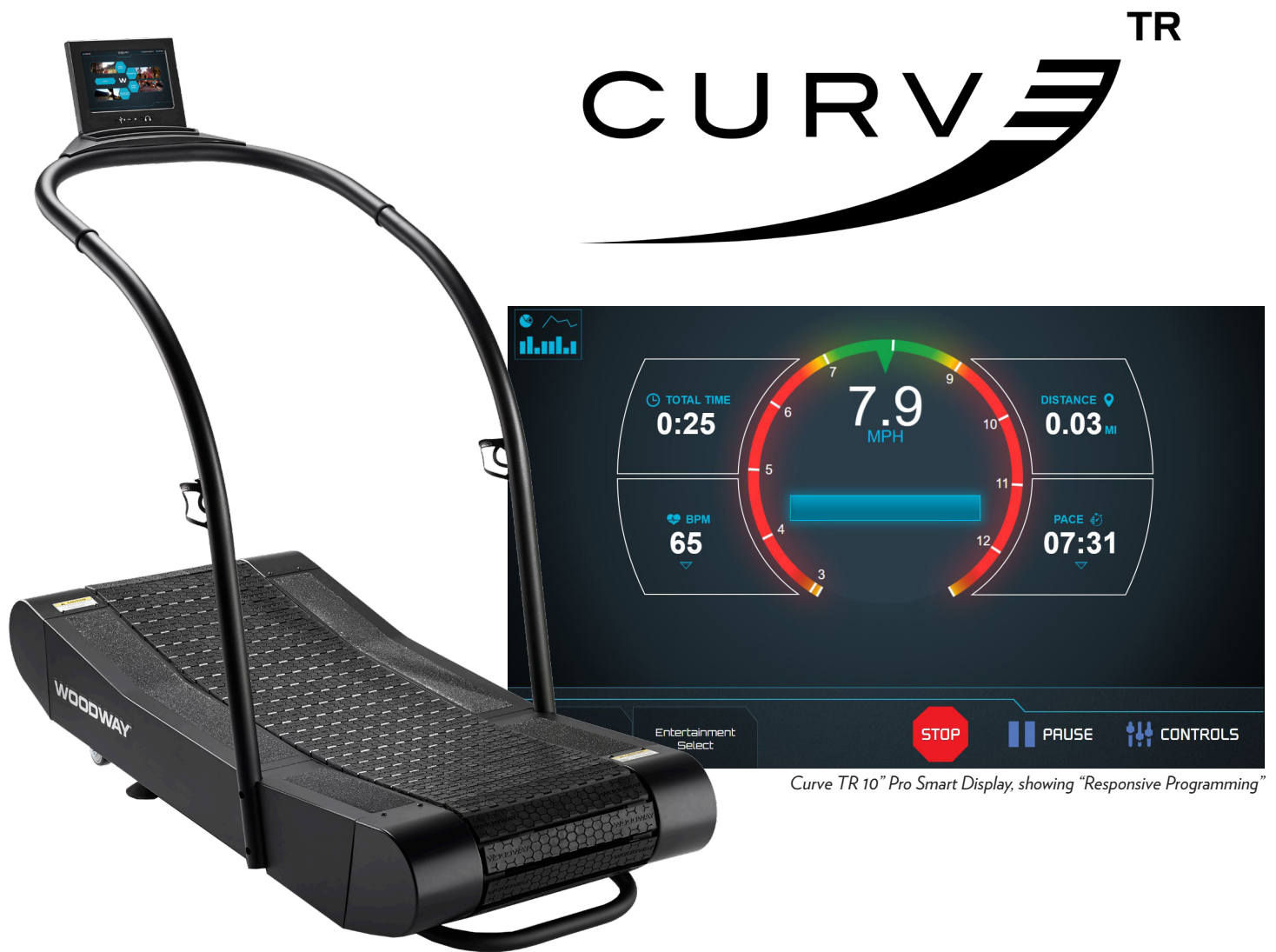
Curve TR 10" Pro Smart Display, showing "Responsive Programming"

With unlimited mobility the Curve Trainer allows the user to take full control of their workout allowing for easy transitions between various speeds and tempo runs. Not in the mood to run? The Curve Trainer also makes for a great walking platform while still providing all the direct benefits of running. Burn up to 30% more calories on this completely self-powered machine delivering an unparalleled workout providing leading edge technology including Responsive Programming, workouts based on user ability and effort, and Stride Lab, an advanced user performance dashboard.