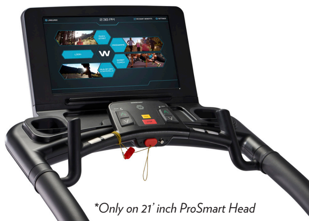
*Only on 21' inch ProSmart Head